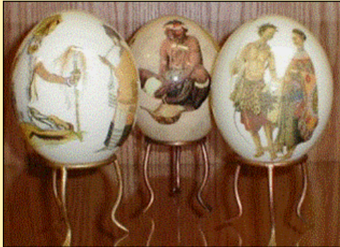
Painted ostrich eggs

A remarkable range of arts and crafts are produced by South African people.