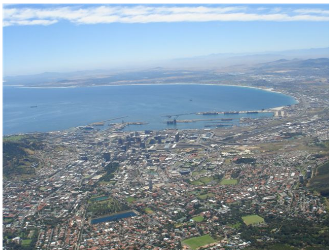
View of Cape Town from Table Mountain

Cape Town is beautiful and much like the Mediterranean. Located on the Southwestern tip of South Africa, Cape Town was established in 1652 as a supply outpost for the Dutch East India Company.