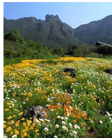
Kirstenbosch Botanical Gardens

South Africa has eleven official languages. The two most common used are currently Afrikaans and English.